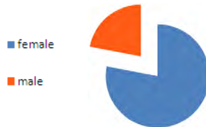
Hobbies & Interests