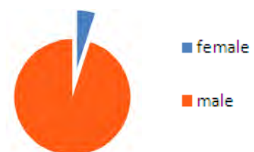
Gender and Social Grade